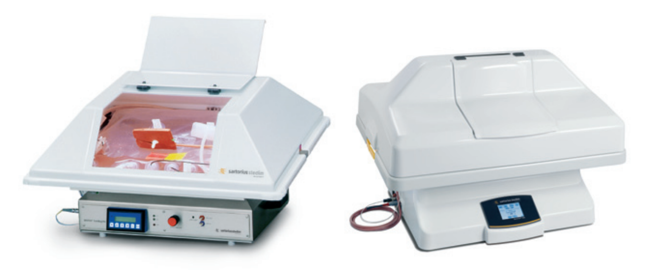
Figure 1: Left: Image of first generation BIOSTAT® RM (previously marketed under the name BioWave 20 SPS). Right: Image of second generation BIOSTAT® RM II.

The cell culture inoculums (starter culture) is manufactured by using single use equipment and disposable materials. We are working with Wave Bioreactors of 10 L up to 300 L working volume.